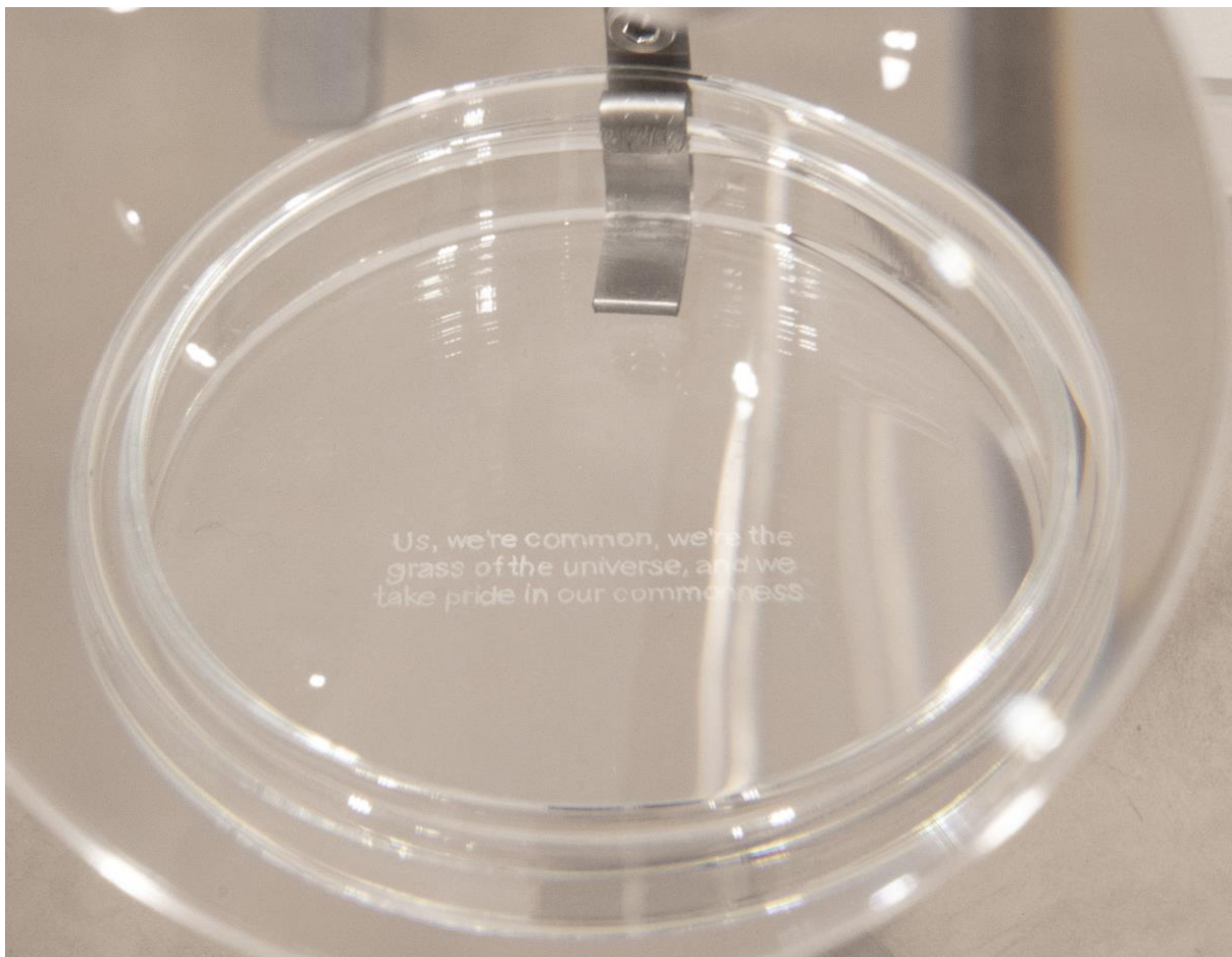
Micromessages I.

Annotation: Originally produced for an interdisciplinary group exhibition Confluence at Marignana Arte in Venice, Micromessages I-III are three sculptural objects featuring petri dishes with miniature text engravings visible only through magnifying lenses. The aesthetics of the objects reference to laboratory apparatuses used to make microscopic aspects of nature visible and sensible. In this case, the role of laboratory tools is reversed – they turn human ideas, which are standardly visible in exhibition spaces as textual inscriptions, into invisible, thin layer resembling a biofilm prepared for chemical examination. The engravings feature three citations by sci-fi authors Karl Schröder and Stanisław Lem, as well as a theologian Marika Rose, which all address the embeddedness of human technology and culture in biogeochemical substrate of our planet.