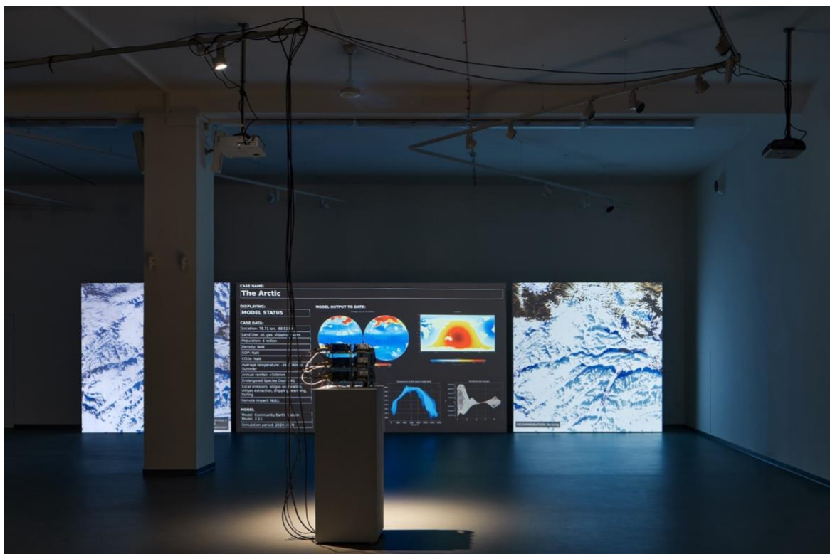
Installation view of Asunder (2019) by Tega Brain, Julian Oliver, and Bengt Sjöln at the National Museum of Agriculture in Prague during Fotograf Festival 11.

Annotation: The eleventh edition of the Fotograf Festival tasks itself with uncovering the traces, perspectives, and signals offered by the planet itself, and their channelling into the broad field of aesthetic practices that help us understand what it means to be Earthlings – competent observers of the changes taking place in our immediate surroundings – both generally and here and now, in Central Europe. At present, the public debate is dominated by the authority of expert images that describe ongoing changes and forthcoming catastrophes. Only seldom do we encounter images that exceed the established norms of scientific representation. Moreover, those people who are directly affected by environmental changes are heard little or not at all. The presence of the planet as an active force producing its own images and means of disseminating them, however, gives power to these unheard voices and unseen images.