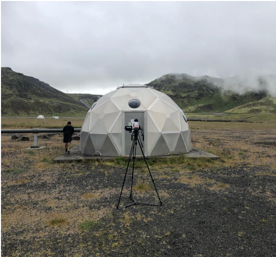
Filming of Invisible Landscapes (2022, dir. Ivo Bystřičan) at Hellisheiði.

Annotation: Multidisciplinary research project, podcast, and a documentary film about sonic profiles of infrastructural landscapes, which uses methods of field recording to understand the places where energetic, agrarian, natural, and political processes take place. Sound is the starting point for revealing elements, relationships, and structures that are not visible and yet foreshadow the challenges of the near future, thus posing the question: What does sound tell us that image does not?