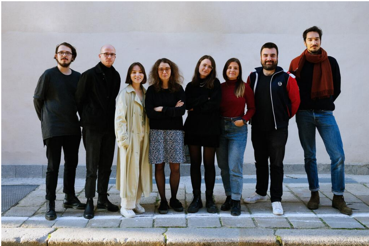
Visuals and members of the first cohort of IF LAB.

Annotation: The Inspiration Forum Lab is an interdisciplinary research program of International Documentary Film Festival Ji.hlava, designed to provide a space where artists and scientists can meet and work together on creating collaborative research-based art projects. The aim is to combine the languages of science and art to find forms of expression that can communicate to audiences beyond the boundaries of each of these two worlds. The first iteration of the program in 2021-22 brought together 9 researchers exploring the topic of “Limits to Growth”.