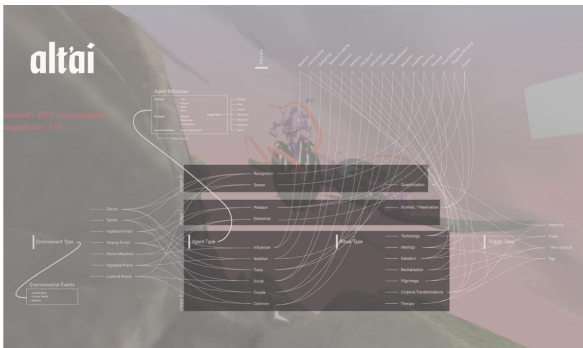
Diagram of agent-based simulation Alt'ai (2018-19).

As the questions regarding climate change and human activity in nature intensify, Architectures of Nature lecture series comprises of contributions by contemporary architectures theorists. The series focuses on how architecture influences construction of what used to be colloquially known as 'nature', both in reality and in various domains of cultural imagination.